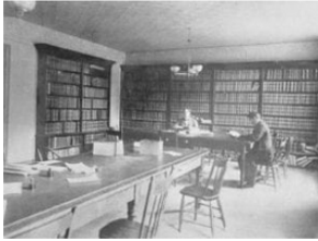
Law Library at Emory Hall