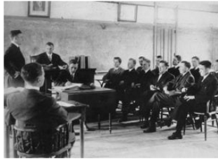
Class in Emory Hall

Emory Hall opened for classes on October 1, 1890. However, it soon became apparent that despite the improvements made to the building, a new home for the school was required. The Law School occupied Emory Hall through 1917, before moving to its new home, Trickett Hall, in January 1918. Emory Hall was thereafter sold and torn down.